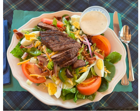
Cable's delicious Steak Salad.

Call us about hosting your special event!