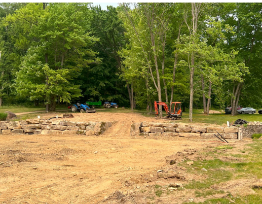
Finished retaining wall for the pavilion.

Making the "omelet" will mean a couple broken eggs – some of the holes will play to temporary greens during the Fall, and there will be noise while we build