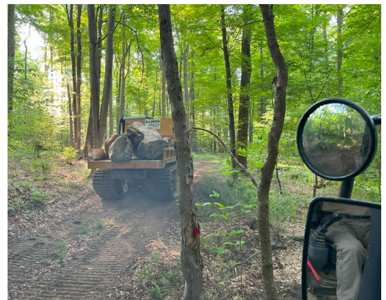
Gathering rocks for the pavilion wall.

All the best, and keep it in the short grass!