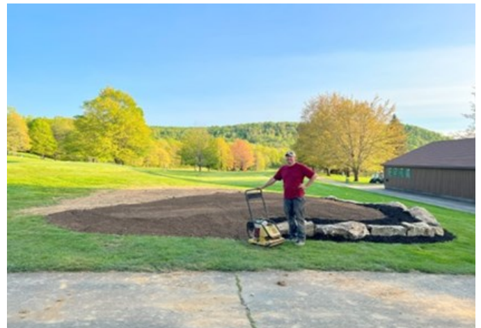
Tyler building one of the new tees on the first hole.

Track me down if you have any concerns—I'm at the course every day.